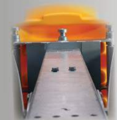
Steel Barrier Attachment