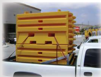
SLED™ TL-3 Transports in a Pick-Up Truck