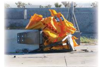
Inline TL-3 Truck Test Post Impact