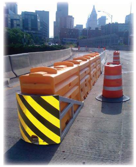
SLED™ TL-3 in Downtown Cincinnati, Ohio