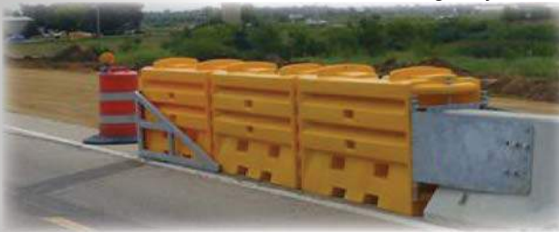
SLED™ TL-2 in Illinois