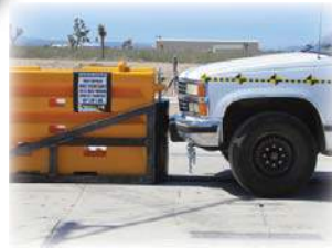
Inline TL-3 Truck Test Pre Impact