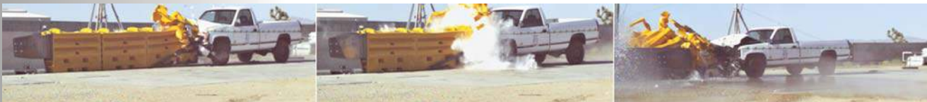
SLED™ TL-3 4500 lb. Pick-Up Truck Impact Attached to Concrete Median Barrier Wall

Each SLED module is manufactured from a high visibility yellow polyethylene that is UV stabilized to minimize degradation. It is designed to deform and rupture on impact, absorbing the energy of the errant vehicle. SLED has the most versatile transition for shielding all permanent and temporary portable barriers. The combination of hinging and contouring, allows the transition panels of the SLED End Treatment to be attached to narrow, wide or other profile shapes with either converging, or diverging angles, up to 10 degrees.