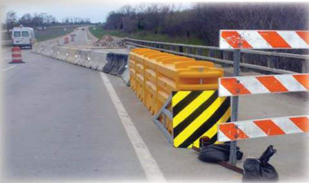
SLED™ TL-3 in use on a Missouri Highway