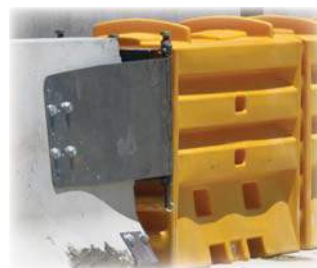
Concrete Barrier Attachment